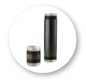
Included 2.5" and 7" pipes