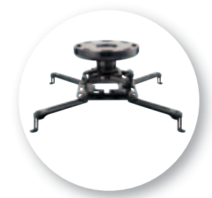
All pieces included