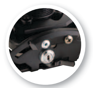
Key and lock system